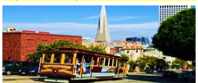
Day 01: Arrival – San Francisco

Begin your tour in San Francisco. The city's well-known hills offer stunning views of the Pacific Ocean and San Francisco Bay, and serves as a gateway to Silicon Valley, America's premier hightechnology center. Upon Arrival, check in to the hotel.