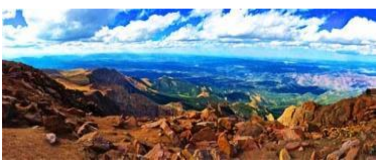
Day 07: Denver - Pikes Peak Region

Today you will enjoy a day exploring Pikes Peak Region. This is the world's most famous mountain, Pikes Peak. You will visit United State Air Force Academy, Cadet Chapel, Pikes Peak Highway, and Garden of the Gods. The breathtaking views will stay in your memories long after your vacation is over. (Meals: B)