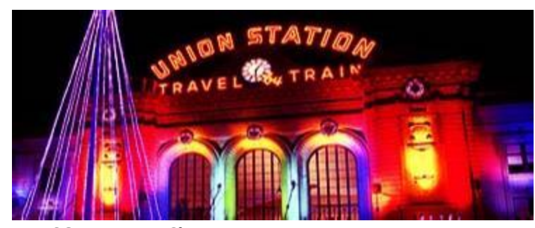
Day 06: Denver - City Tour

Today you will visit the NASA Johnston Space Center in Houston. You will be guided through all the exhibits at the Houston Space Center. You will learn about the real space pioneers who made the dream a reality. Walk with people who have dedicated their life to exploring space. (Meals: B)