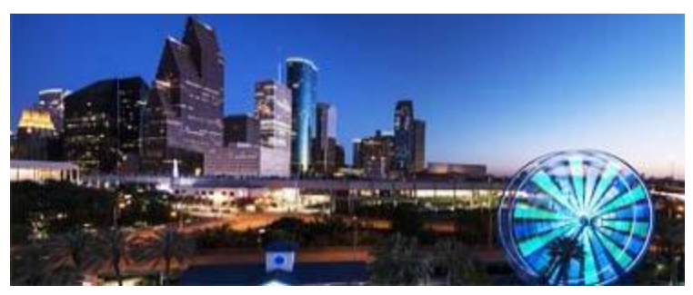
Day 04: Houston – City Tour

Today you will go on the Chicago River & Architecture Tour; you will take a cruise on the historic Chicago River where you will see over 40 landmarks of modern American Architecture. You will see buildings by world-famous architects including Mies Van Der Rohe, Skidmore Owings & Merrill, and Helmut Jahn. Enjoy rest of day at leisure. (Meals: B)